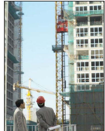
Cisco IMICS can provide on-demand networks for construction and other temporary sites.